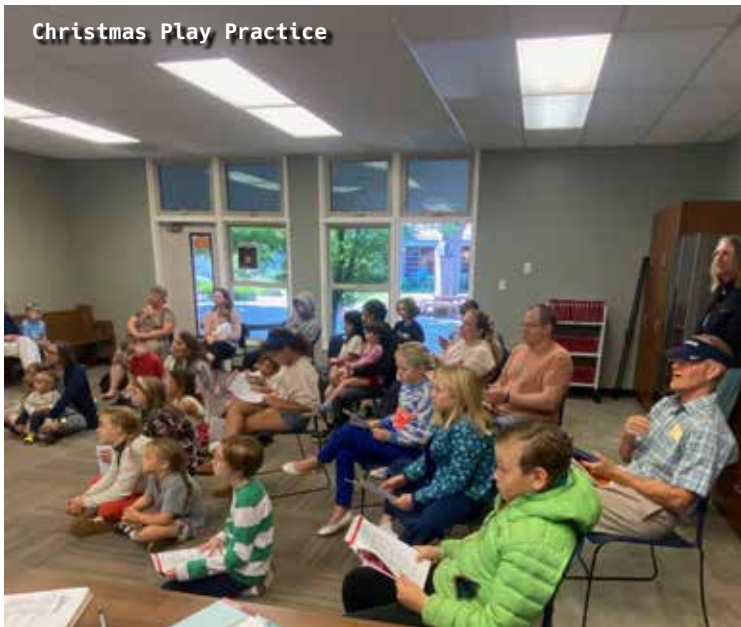
Christmas Play Practice