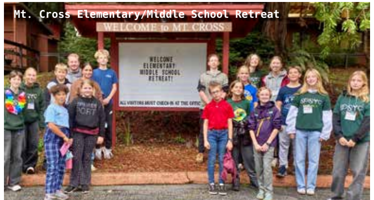
Mt. Cross Elementary/Middle School Retreat